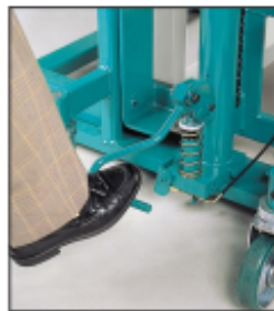
Easy Lifting by pumping pedal Pedal can be folded (Manually Operated Models)