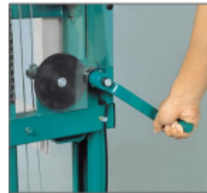
Quick Lifting Device (Manually Operated Models)

When placing an order, please be sure to write "Fast-uplifting device (H)"