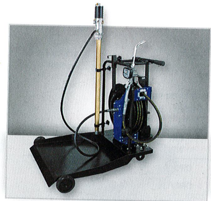
Trolley being used as a dispensing system with Ratio Pump & Hose Reel installed