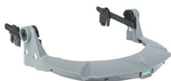
10121267 - V-Gard Standard frame ET (Elevated Temperature)