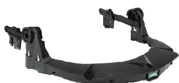
10121266 – V-Gard Standard frame for slotted helmets