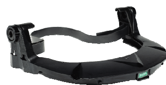
10121268 – V-Gard Universal frame