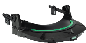
10115730 – V-Gard Standard frame for slotted helmets with debris control