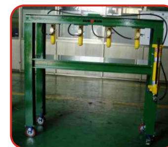
RSC & 泵浦特殊訂製 RSC & Pump -specific purpose