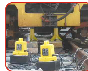
RSC-25噸 復軌實例應用 RSC-25 ton rail way application