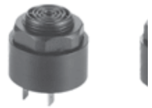
KPEG650/650A KF KPEG650AN/610AN KF KPEG648 KF