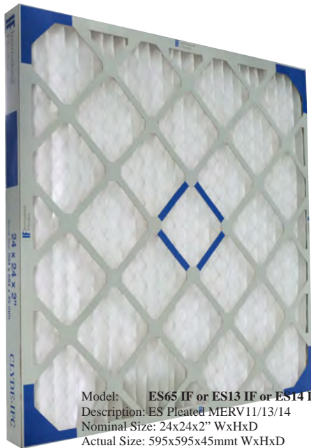
Model: ES65 IF or ES13 IF or ES14 IF Description: ES Pleated MERV11/13/14 Nominal Size: 24x24x2" WxHxD Actual Size: 595x595x45mmt WxHxD Thickness available 1" 2" 4"

ES Pleated Disposable is of extended surface and fully disposable. They can be used as primary / prefilters/Secondary filters in Fan Coil Units (FCU), Air Handling Units (AHU) or Fresh Air Fans (FAF), Cassette FCU in both new or existing air filtration system. The flat media pad can also be used as filter in split units to prevent dust build up in the coils. The pleated filter has greater extended surface allowing higher dust holding capacity and longer replacement intervals compared to flat panel filters. It is used as a pre-filter which considerably extends the life of other secondary filters in the filtration system. The higher efficiency filter greatly prevents dust build-up on heating and cooling coils, fans and duct. Reduced Coil cleaning frequency and inenergy savings.