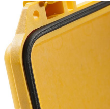
1553 Replacement O-ring