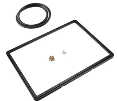
1550PF Special Application Panel Frame