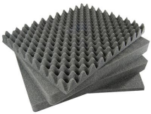
1551 4 pc. Replacement Foam Set