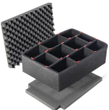
1550TPKIT TrekPak Case Divider Kit