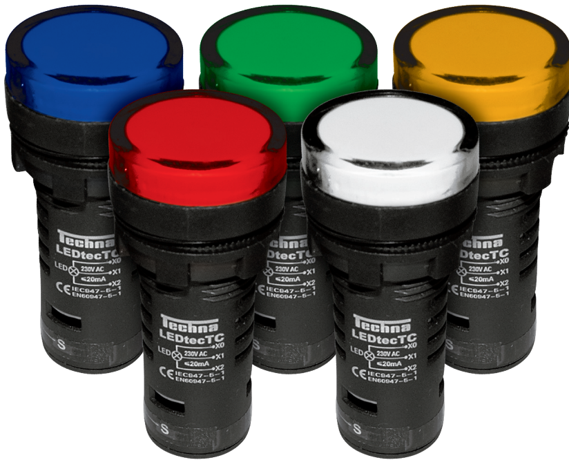
Representative of range