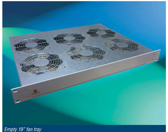
Empty 19" fan tray