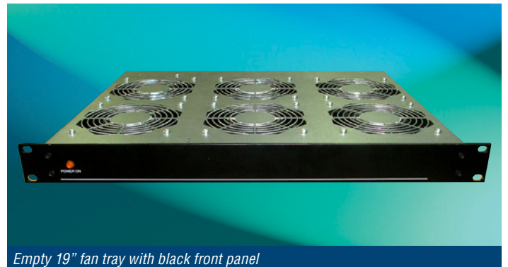
Empty 19" fan tray with black front panel