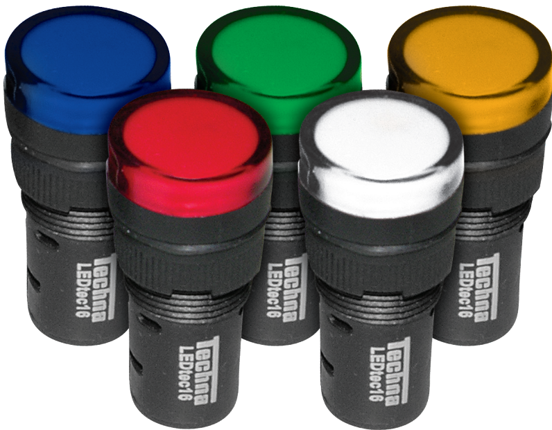
Representative of range