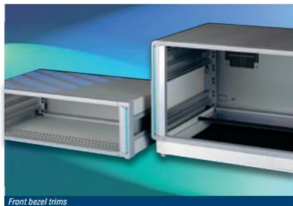
Front bezel trims