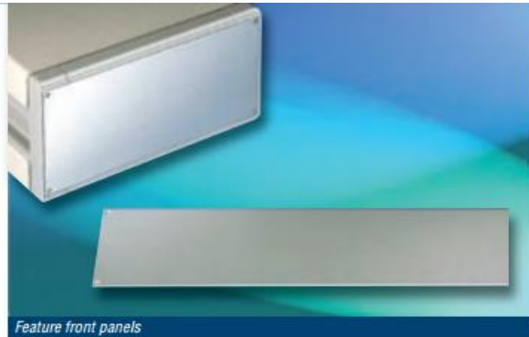
Feature front panels