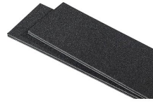
1615TPDIV Extra TrekPak Dividers