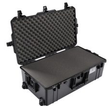
1615WF With Foam