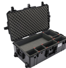
1615TP With TrekPak Divider System