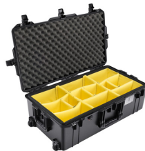
1615WD With Padded Dividers