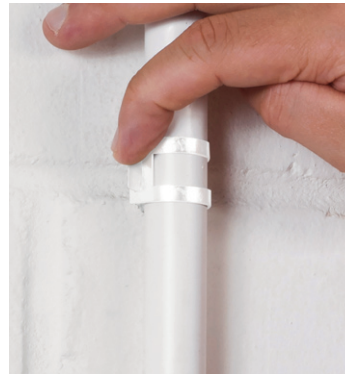
Secure conduit with locking tab