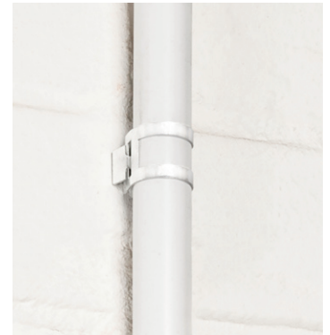
Centralised base fixing, gives a neat appearance to installation

Safe-D Conduit Clips combine fire performance, quickest fix, and a modern look, to secure cables in 20mm outer diameter PVC conduit installations... (or exposed 20mm o/d cables and pipes).