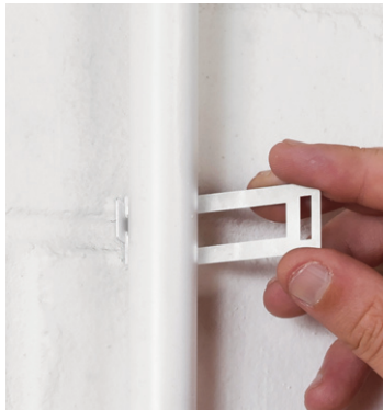
Provides a 3mm stand off from the surface