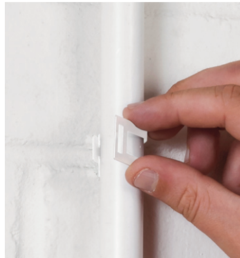
Simply wrap around the conduit, perfect for tight spaces