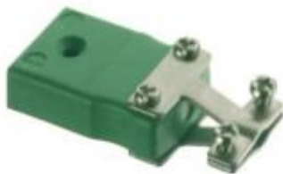
Miniature clamp when fitted