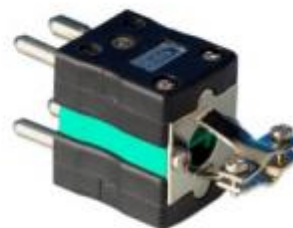
Standard Duplex clamp when fitted