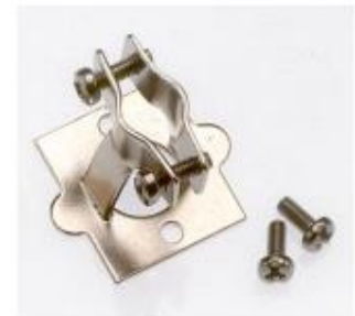
Standard (Duplex) Clamp