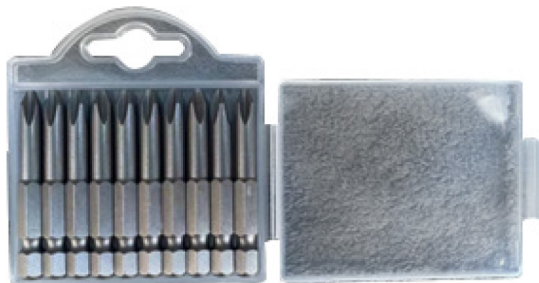
Driver Bit Set