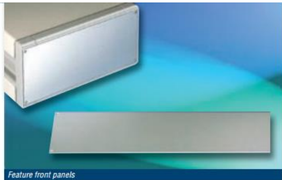
Feature front panels