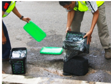
Fill in with Ultracrete IRR