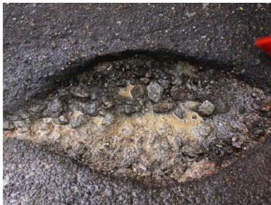
Brush out debris

Ultracrete Instant Road Repair is a suitable solution for roads, pavements, driveways & car parks. The product can be installed instantly in wet, freezing & hot conditions & at the same time is compatible with the existing road surface. Ultracrete IRR can be applied at depths of 20mm - 100mm. (greater depths can be achieved by applying the layer on layer method)