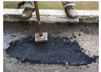
Tamp down. Ready for trafficking