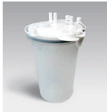
1200 ml re-usable collection bottle