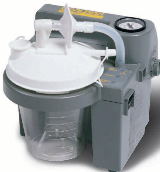
7305P-U with 800ml disposable bottle