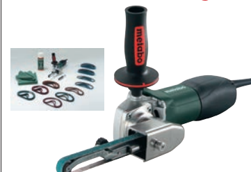
900W Electronic Band File Set