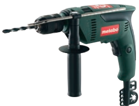
560W Lightweight Impact Drill