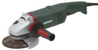
1700W Angle Grinder