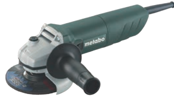
780W Grinder with clw Dead-Man Switch