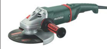
2400W Angle Grinder