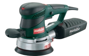
350W Electronic Disc Sander