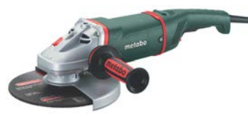
2600W High Torque Grinder