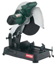
2300W Metal Chop Saw