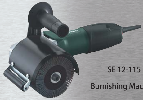
SE 12-115 Burnishing Machine