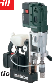
Cordless Magnetic Core Drill