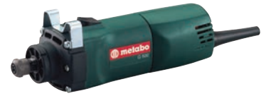
500W Die Grinder