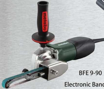
BFE 9-90 Electronic Band File