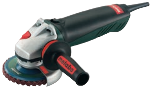
1450W Electronic Angle Grinder