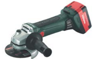
18V Cordless Angle Grinder