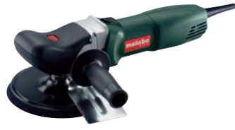
1200W Angle Polisher