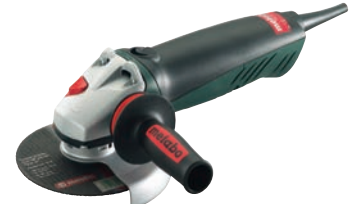
1450W Variable Speed Grinder / Grinder with Autobalancer