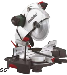
12" Cross Saw