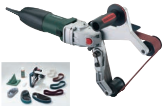
1200W Electronic Pipe Belt Sander Set