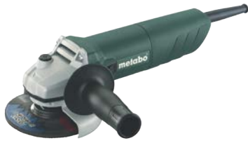
720W Lightweight Grinder