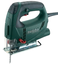
590W Jig Saw with Quick Blade Release