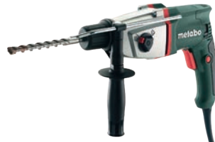
2x Mode, 810W Rotary Hammer