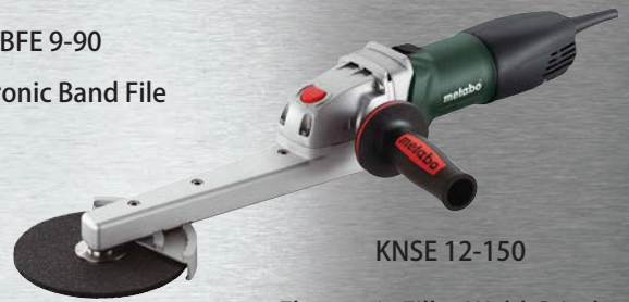
KNSE 12-150 Electronic Fillet Weld Grinder