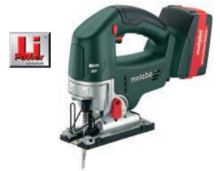
18V Cordless Jigsaw