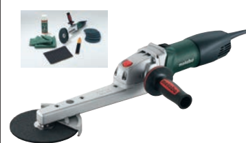
1200W Electronic Fillet Weld Grinder