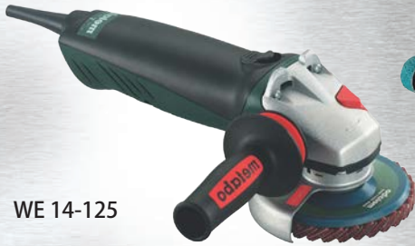
WE 14-125 Electronic Angle Grinder