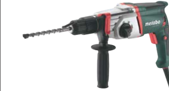
3x Mode, 1010W Combination Hammer