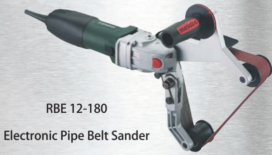
RBE 12-180 Electronic Pipe Belt Sander