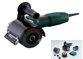
1200W Burnishing Machine Set