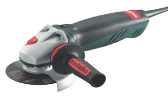
850W Lightweight Grinder