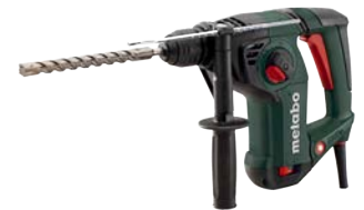
800W Combination Hammer