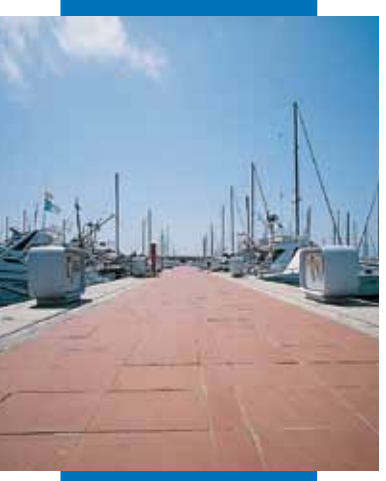
New harbor in Civitavecchia: outdoor installation of terracotta with Keracrete