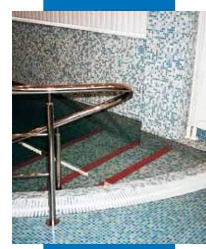
Laying glass mosaics