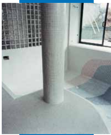
Installation of mosaics