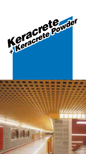
An example of an installation of Granitello in underground -Linea 3 - Milan (Italy)