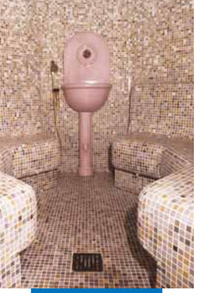
An example of an installation a glass mosaics in a turkish bath - Park Hotel Gritti -Bardolino (Verona), Italy