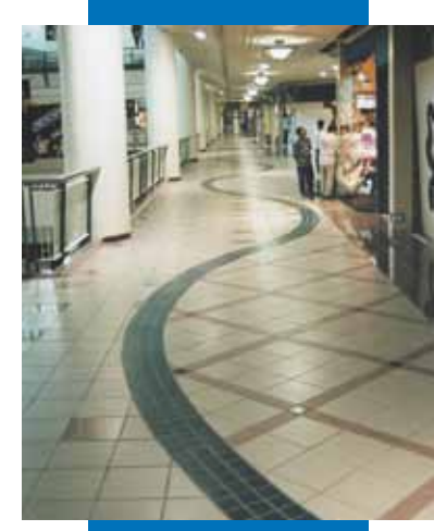
An example of an installation of ceramic tile in a mall - Filinvest Festival Superhall -Manila (Philippines)