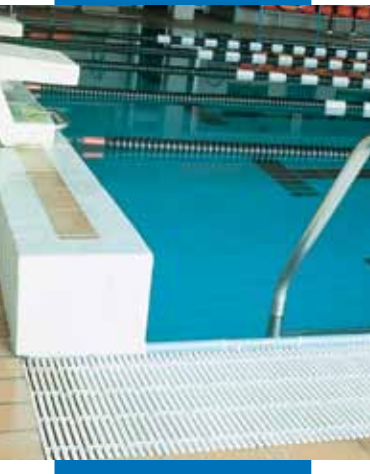
An example of an installation of mosaics with Keracrete + Keracrete Powder in a swimming pool