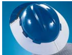
V-Gard Sun Shield