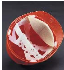
Swing-Ratchet Suspension System (Left) Uni-Pro® Suspension System (Right)