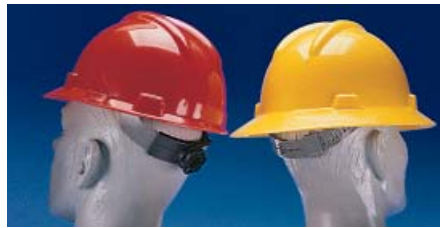
Fas-Trac® (Left) and Staz-On® (Right) Suspension Systems