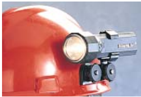
Stealthlite & Light Holder for Slotted Caps