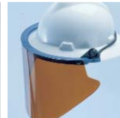
Universal Plastic Defender Foldback Faceshield Frames (Cap Left, Hat Right)