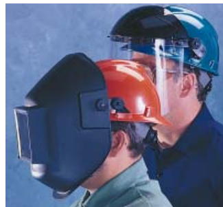
Standard Adapter and EC Adapter Kit