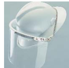
Metal Defender Foldback Faceshield Frames (Cap Left, Hat Right)