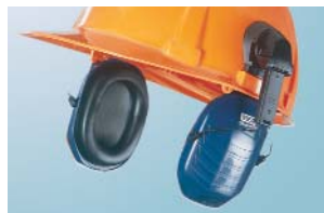
SlimPro™ cap model (shown on Topgard Cap)

Sound Control Cap Models are designed for easy attachment to slotted MSA Caps and help to reduce the effects of excessive noise.