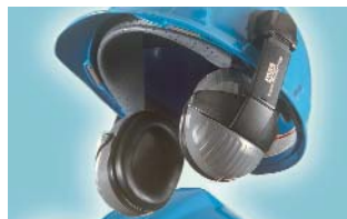
Sound Blocker™ 26 cap model

Hearing protection designed to fit your V-Gard Helmet.