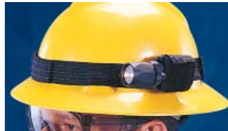
VersaBrite II Light with Light Strap

MSA offers three helmet lights that fit into our special cap or hat adapters. All of the lights are FM and CSA-approved for intrinsic safety, and are non-incendive.