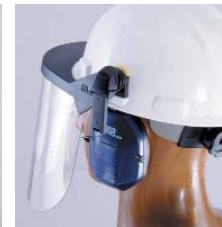
Defender Frame (Left) Defender Frame showing Slim Pro Plus Muff Assembly (Right)