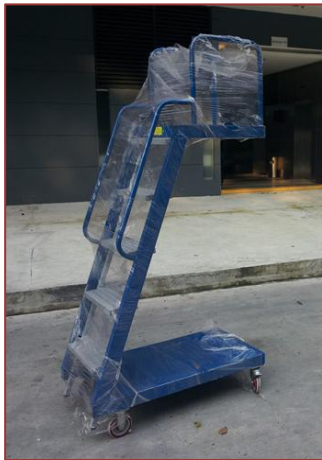
Ladder Trolley LT 5

For safety purpose additional gas spring are designed to prevent contact with pinch points.