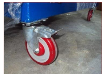
Front Wheel (2 locking Device)

5" Swivel with brake caster wheel suitable for indoor and outdoor operation.