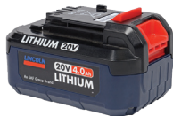
Lincoln 20V 4.0Ah Li-Ion Battery