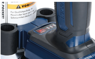
Battery Energy Gauge