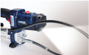
Work light Built-in LED illuminates the work area

The Lincoln model 1886 battery-powered grease gun offers the key features you need for tough jobs - nothing more and nothing less. The versatility of the two-speed design enables you to address all lubrication points with a single tool, protecting equipment and machinery from costly repair and downtime.