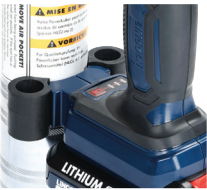
Tube Guide and Hose Holder The holder's unique design allows for secure hose storage, and the tube guide provides easy threading of the grease barrel