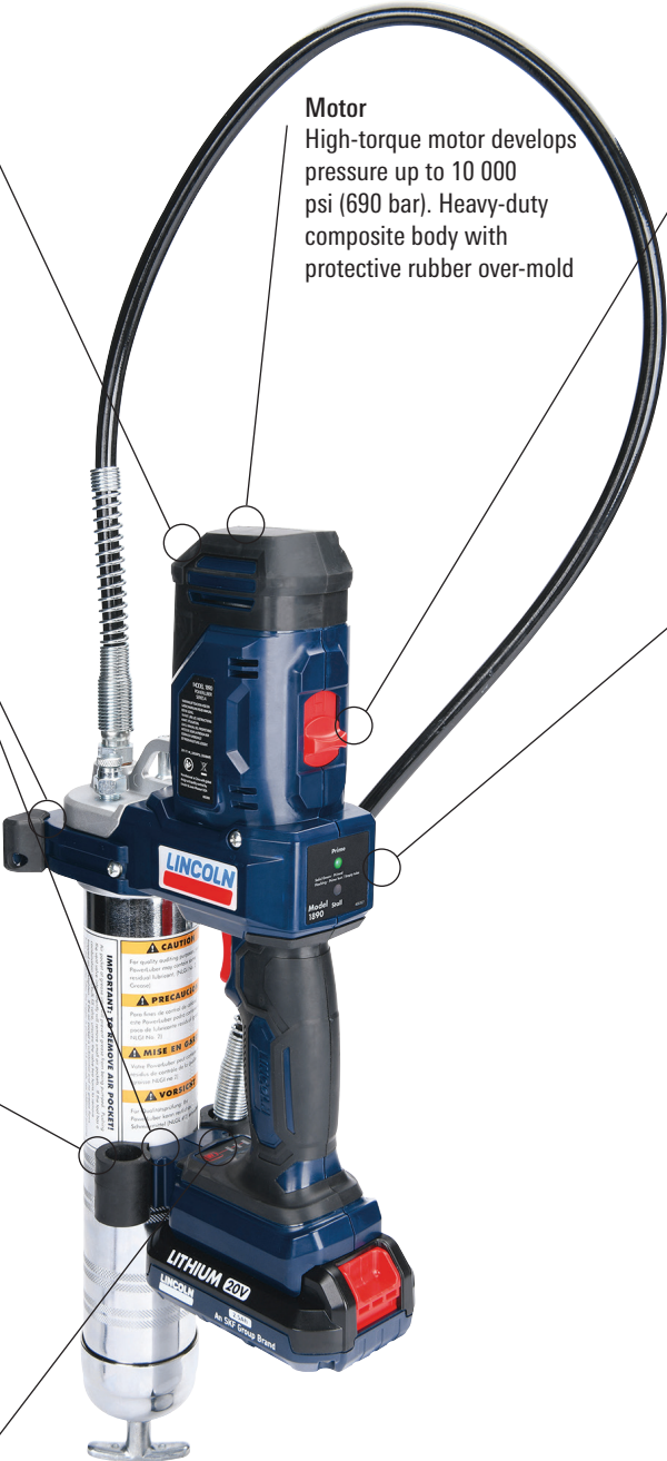
Motor High-torque motor develops pressure up to 10 000 psi (690 bar). Heavy-duty composite body with protective rubber over-mold