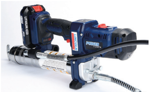
Free Standing Three-point base keep the grease gun upright for easy handling and helps to keep the tool clean. Balanced, ergonomic design weighing 3.4kg.