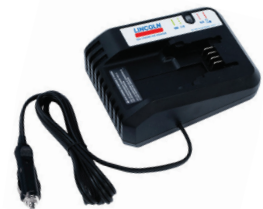
Lincoln 20V Li-Ion Charger - In Car