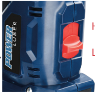
Two-speed dual output for low or high volume lubrication points. Two-speed gear transmission delivers 99 g/min on low and 284 g/min on high.