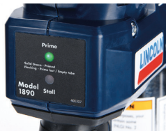
LED Indicators - Prime indicator helps ensure proper lubrication flow - Protective stall indicator identifies blocked fittings