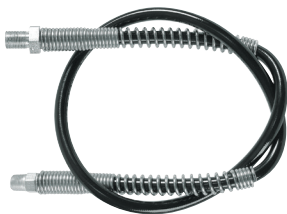
Flexible Grease Hose