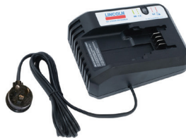
Lincoln 20V Li-Ion 230V AC Battery Charger