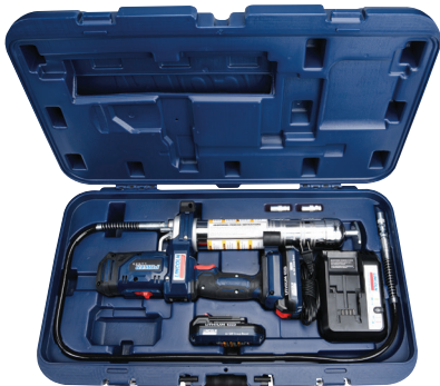
Model 1886 20V PowerLuber, 1871 2.5Ah battery, carry case*, battery charger. *provision for spare 1871 or 1872 battery (order separately)