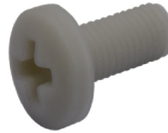
Polymide and Fiberglass