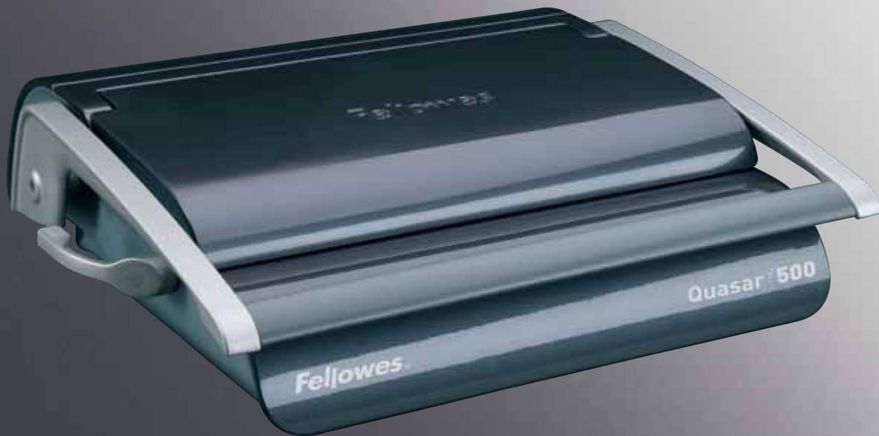
QUASAR WIRE MODEL SHOWN