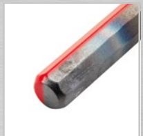
Tempered Safety Head