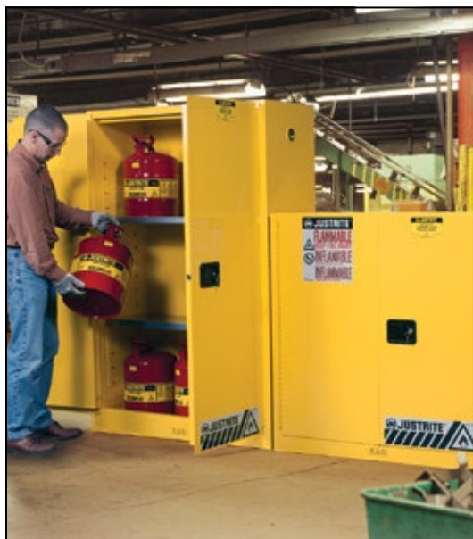
Using multiple cabinets helps you organize and segregate dangerous liquids.