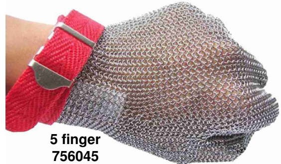
5 finger 756045

The glove and apron passed the European Union's CE standard EN 1082-1:1996