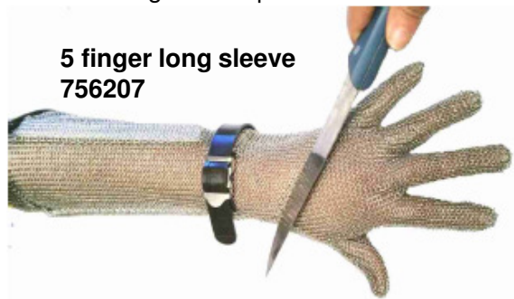
5 finger long sleeve 756207