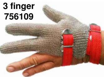
3 finger 756109