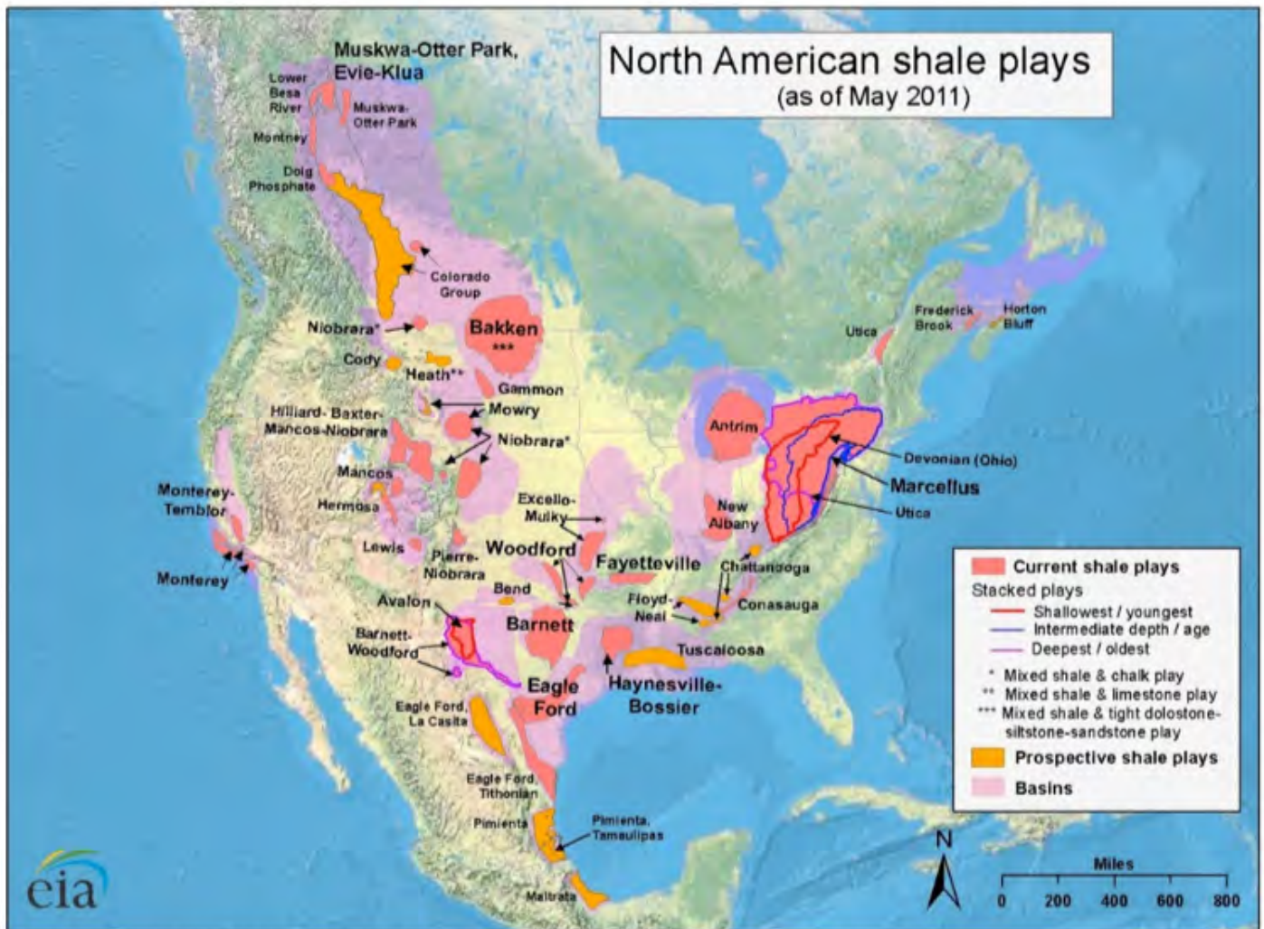
Figure 3. EIA map showing the major shale plays in the USA, Canada and Mexico.