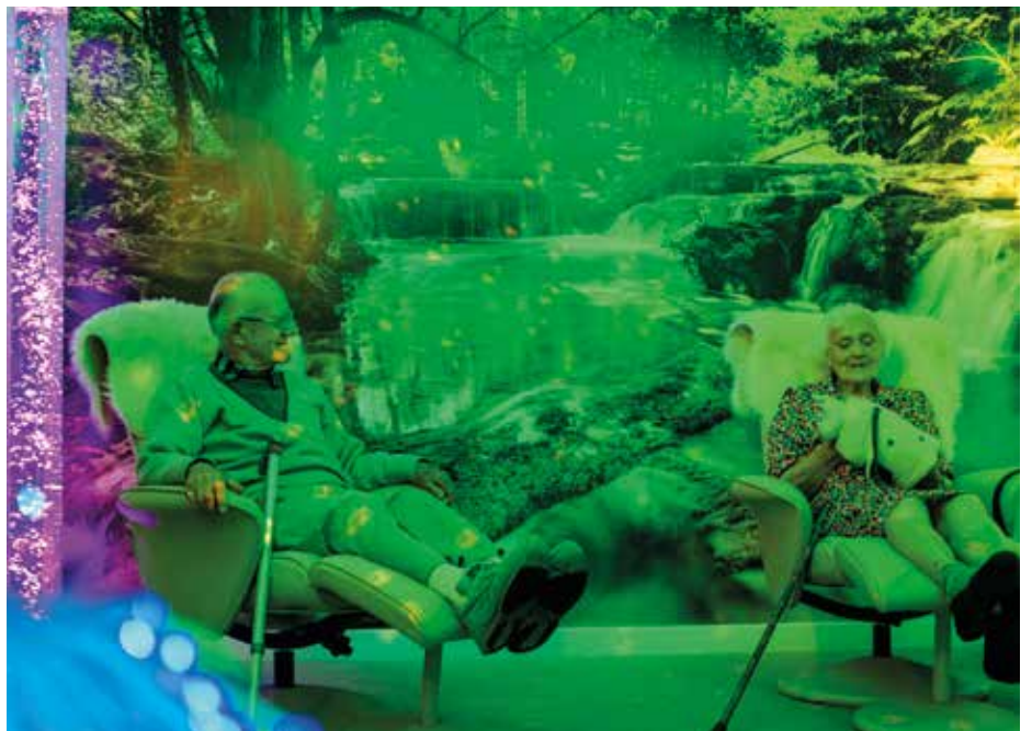
Day Care clients enjoying our sensory room

As part of our Day Care Service, we have introduced a Multi-Sensory Room, which has a calming effect for people with dementia. Multi-sensory therapy consists of the gentle use of light and sound to stimulate senses and engage the individual in a relaxing and non-clinical environment, free from pressures and expectations.