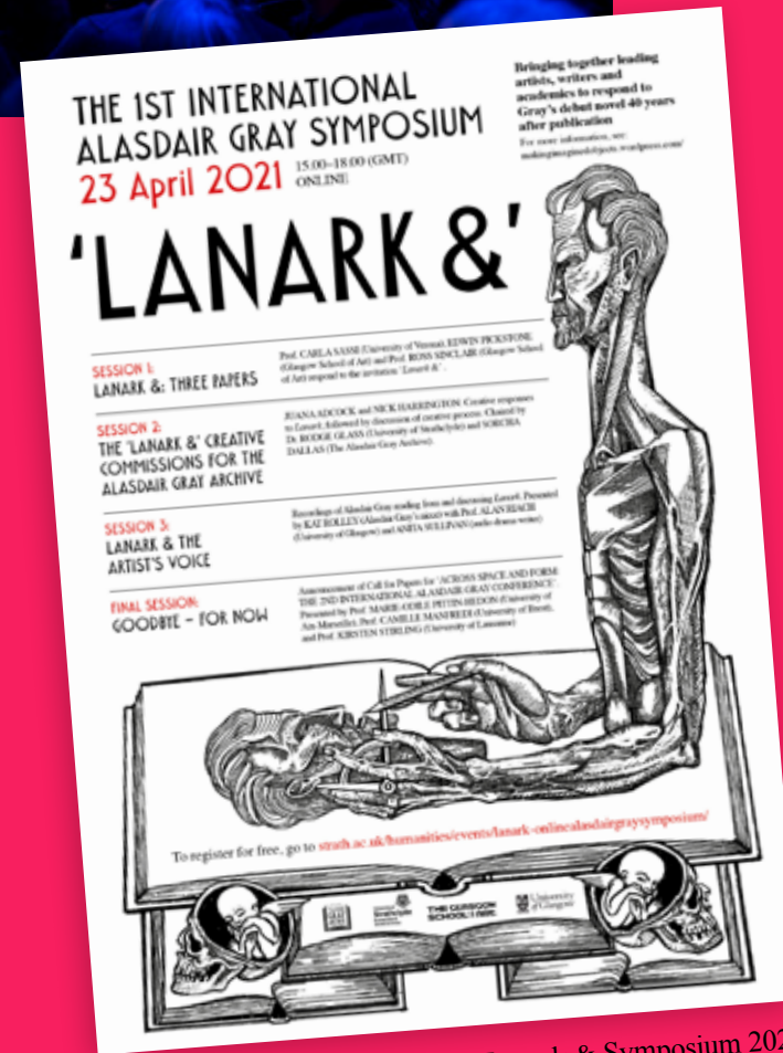
Lanark & Symposium 2021