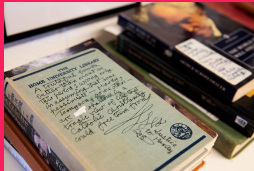
The Alasdair Gray Archive