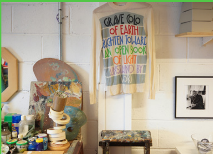
The Alasdair Gray Archive, at The Whisky Bond

We are keen for you to tell us about yourself and in practical terms how you identify and prioritise areas that will make the most difference.