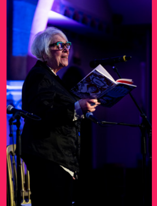
Gray Day 2022