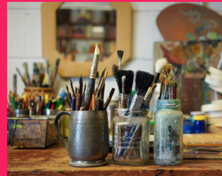
The Alasdair Gray Archive