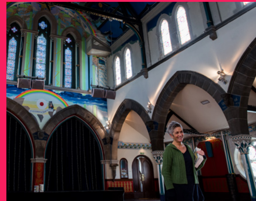
Gray Day 2021