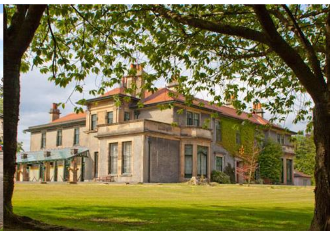
Felden Lodge Conference & Training Centre, Felden Lane, Hemel Hempstead, Hertfordshire, HP3 0BL.