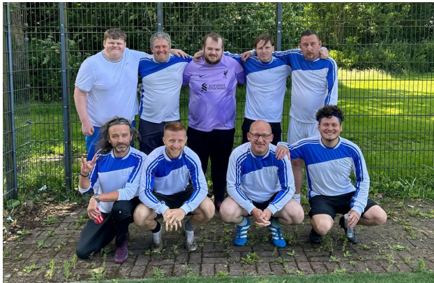
RAMH “Rams” Football Group, part of the RCS physical activity support.

RCS supports adults in Renfrewshire to express themselves and to be empowered participants in their recovery. We support people with counselling, anxiety management, employability, physical activity, social groups, psycho-educational groups, volunteer opportunities and information.