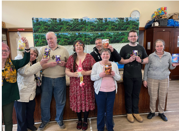
Renfrewshire Social Hub celebrating at Easter

“ I don't know where I would be without RAMH. The weekly activity gets me out and meeting people otherwise I don't think I would get out at all. It's been a big help to me at this time and I can't thank them enough. RCS Physical Activity Service User ”