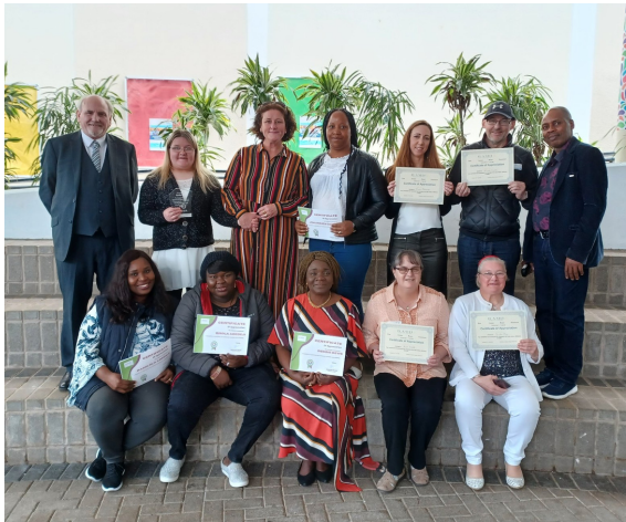
Volunteer Week, June 2022, a coming together with Pachedu "Amongst Ourselves" to celebrate our volunteers

ACUMEN is a network of members with a lived experience of mental ill health operating across Renfrewshire, East Renfrewshire, Inverclyde and in Argyll & Bute. ACUMEN's purpose is collective advocacy on behalf of its members to promote the wider involvement of experts by experience and carers in shaping mental health service and the promotion of recovery and wellbeing.