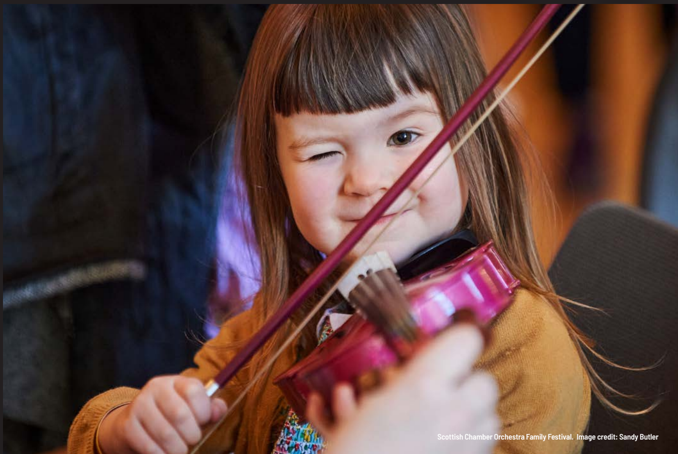
Scottish Chamber Orchestra Family Festival.