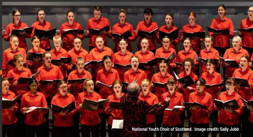
National Youth Choir of Scotland.