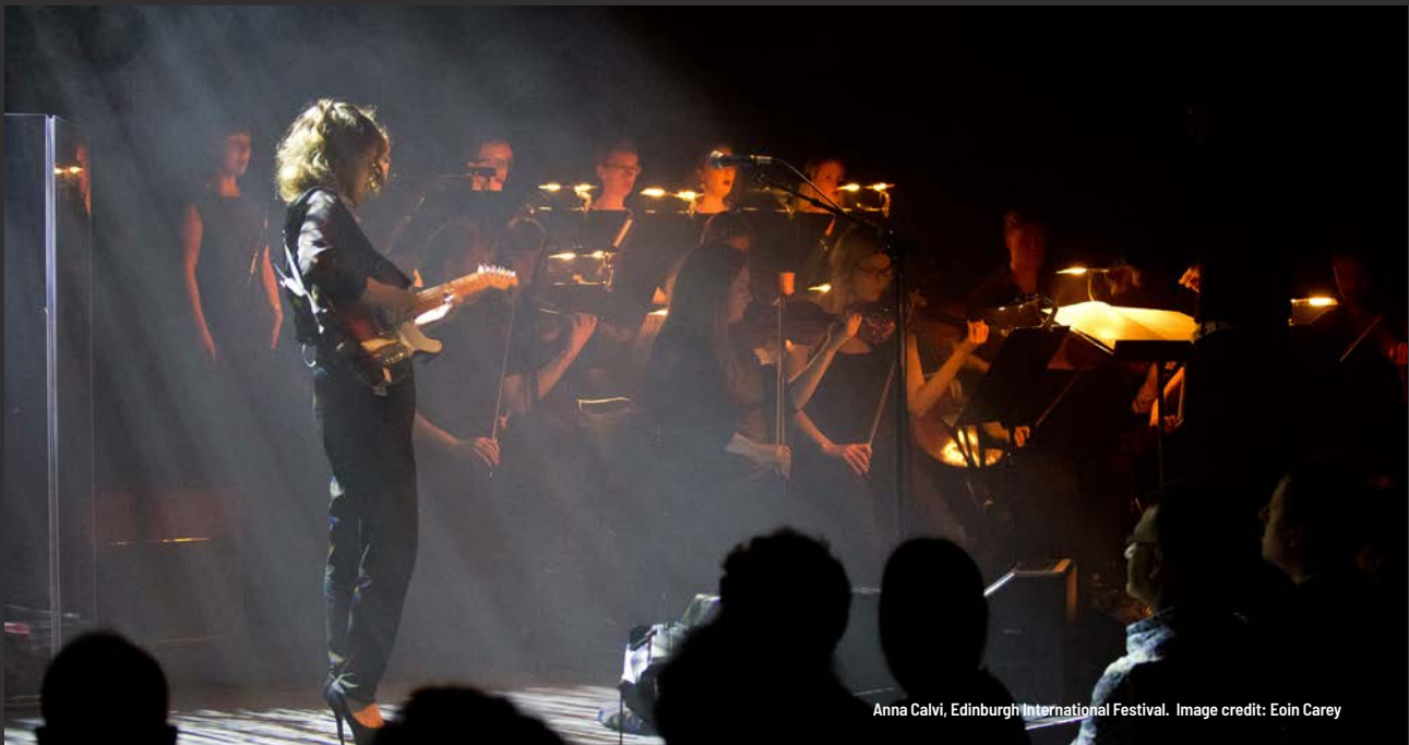
Anna Calvi, Edinburgh International Festival.