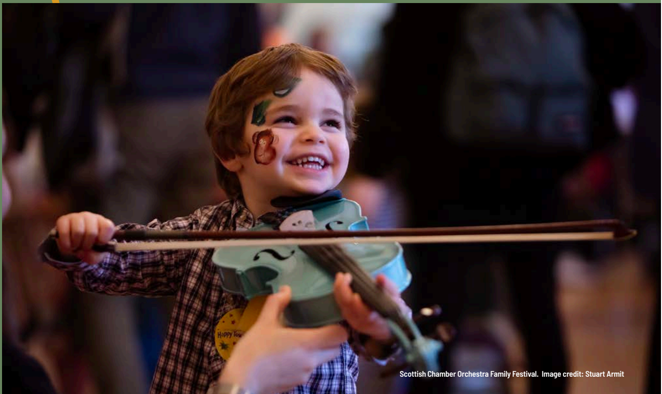
Scottish Chamber Orchestra Family Festival.

We are a small but ambitious and dynamic team that prides itself on its professionalism and inclusivity, where every individual plays a significant part in shaping our work and our future. It is an open and collaborative working environment where ideas, skills and experience are shared, so you can expect to find yourself well supported by the rest of the team. As a new organisation that is in the process of building its permanent staffing structure, this is an ideal post for someone who wants to help make a real difference to our trajectory as the company grows and develops.