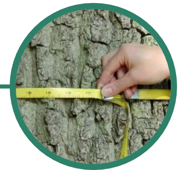
Monitoring & Evaluation