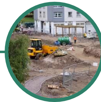
Project & Contract Management