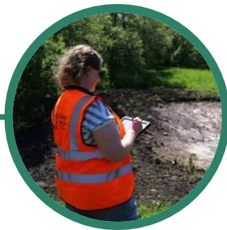
Site Survey & Feasibility