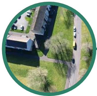
Pre-Project Consultation & Advice

We deliver environmental solutions that include greenspace enhancement; woodland creation and management; transforming vacant and derelict land; green active travel; sustainable water management; and improving habitat and biodiversity. We manage projects from inception to delivery, including the following key stages: