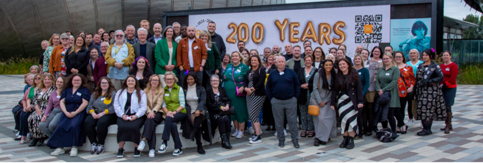
2024 Staff Festival