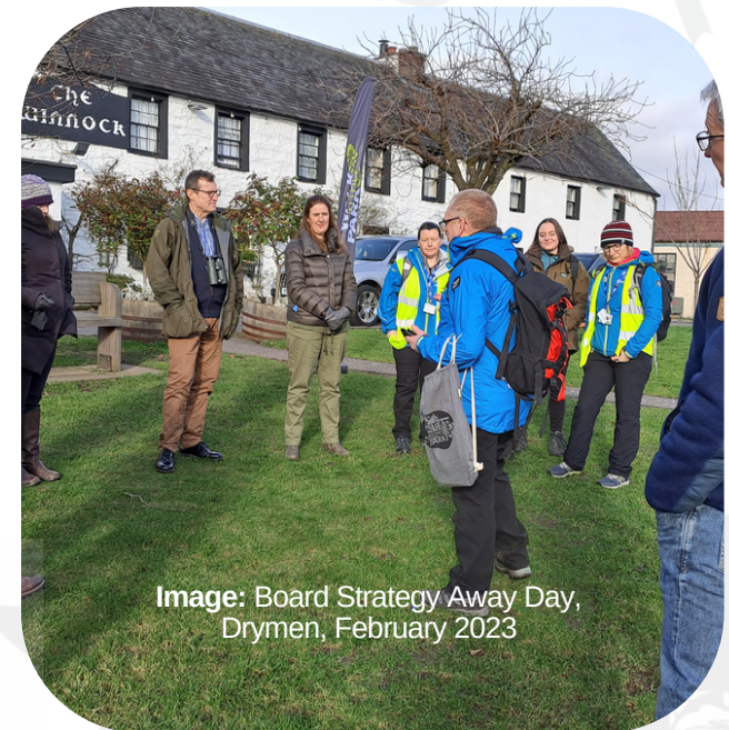
Image: Board Strategy Away Day, Drymen, February 2023