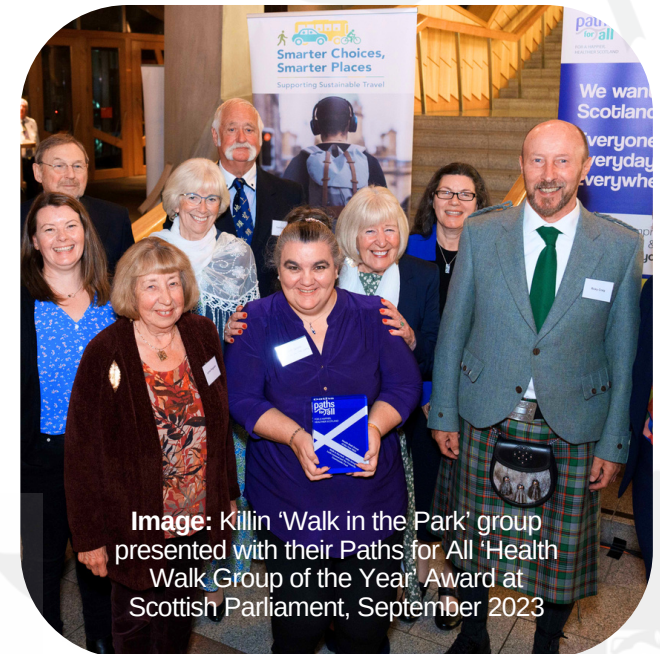
Image: Killin 'Walk in the Park' group presented with their Paths for All 'Health Walk Group of the Year' Award at Scottish Parliament, September 2023