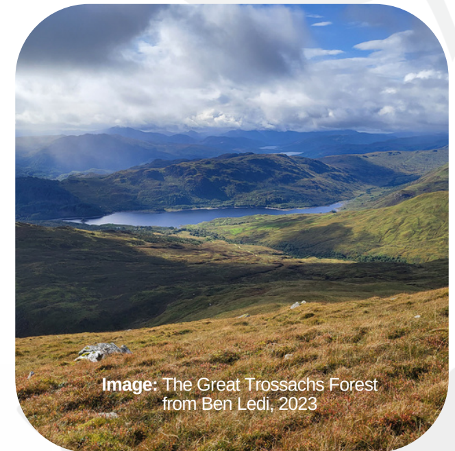
Image: The Great Trossachs Forest from Ben Ledi, 2023