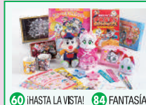
60 iHASTA LA VISTA!