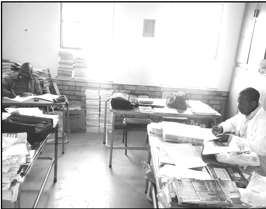
(Ithathwe kuvimba wabevi)

QAPHELA: Phendula yonke imibuzo usebenzisa amazwi akho, ngaphandle kokuba ucelwe ukuba ucaphule.