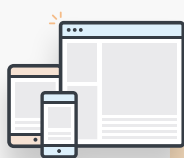
PROVEN LANDING PAGES

We're your mortgage lead generation partner from start to finish and we GUARANTEE you'll generate intentional leads at a reasonable cost. It's a win-win.