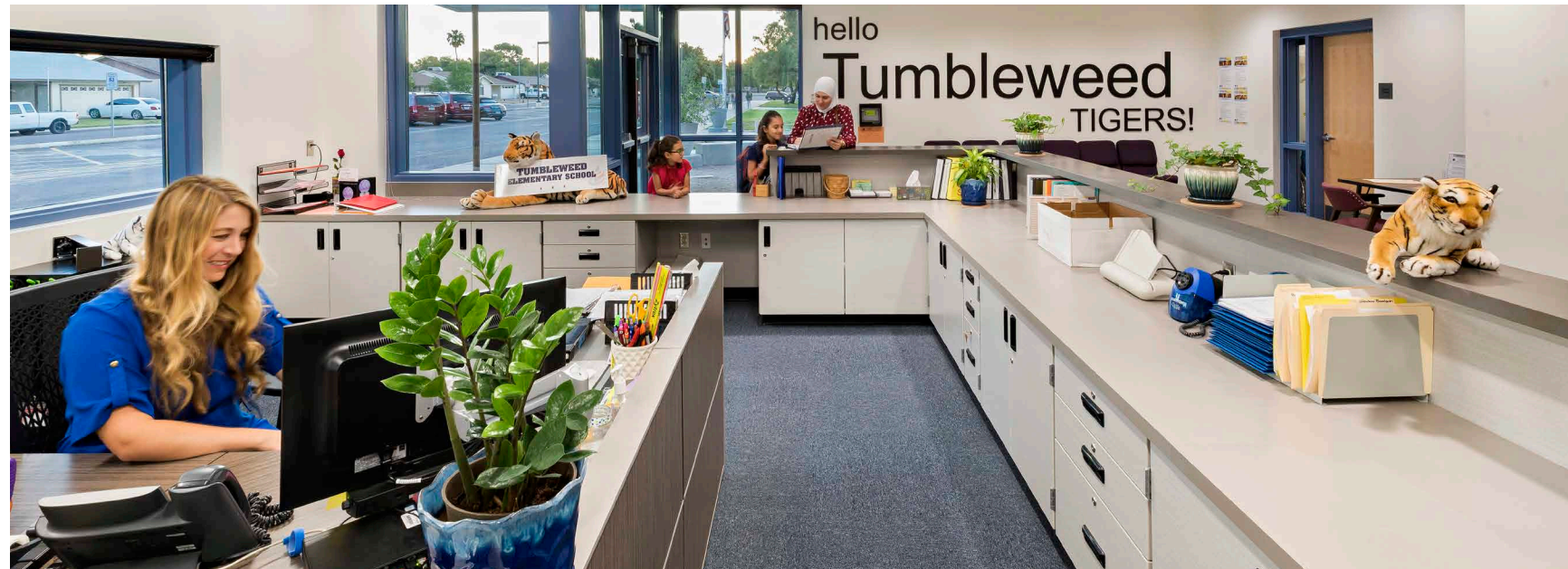
Tumbleweed Elementary School - Phoenix, AR