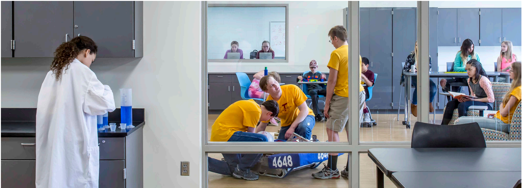
Jordan Middle School - Jordan, MN

Middle school science classrooms should include two walls of base cabinets and upper cabinets with counter space and a minimum of four sinks. Retractable electrical outlets should be incorporated into the ceiling and coordinated with possible furniture layouts for group instruction and experiments. There should be ample tack surface on available wall space. A direct connection to an outdoor learning space is desirable if possible.