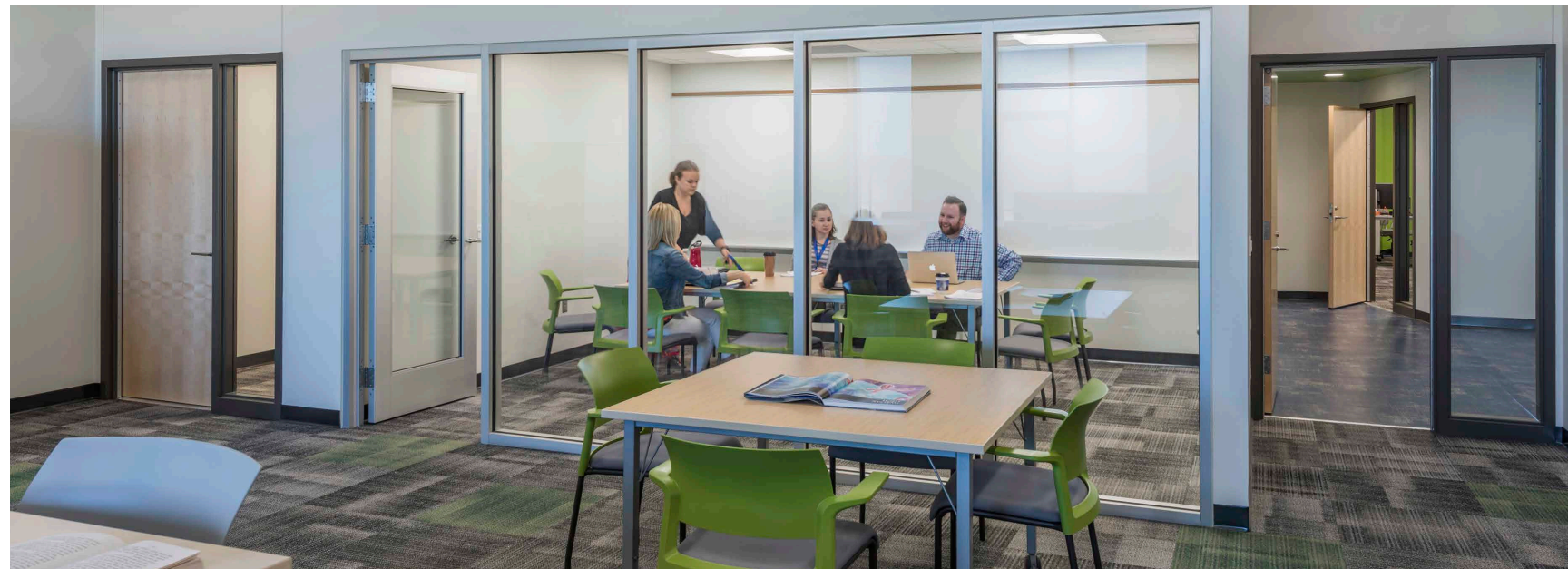
Dickinson Middle School - Dickinson, ND