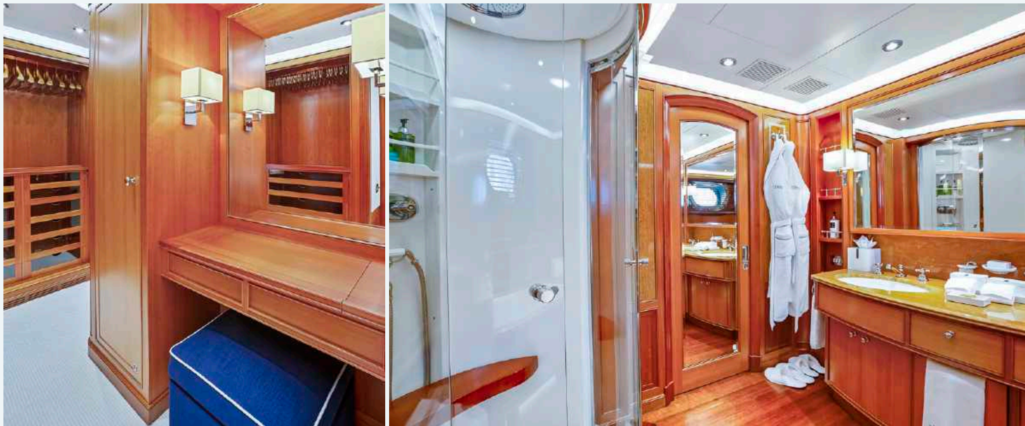
Master Stateroom Bathroom & Dressing Area