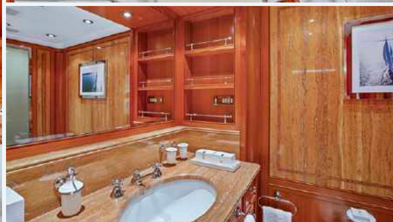
Guest Cabins & Bathroom