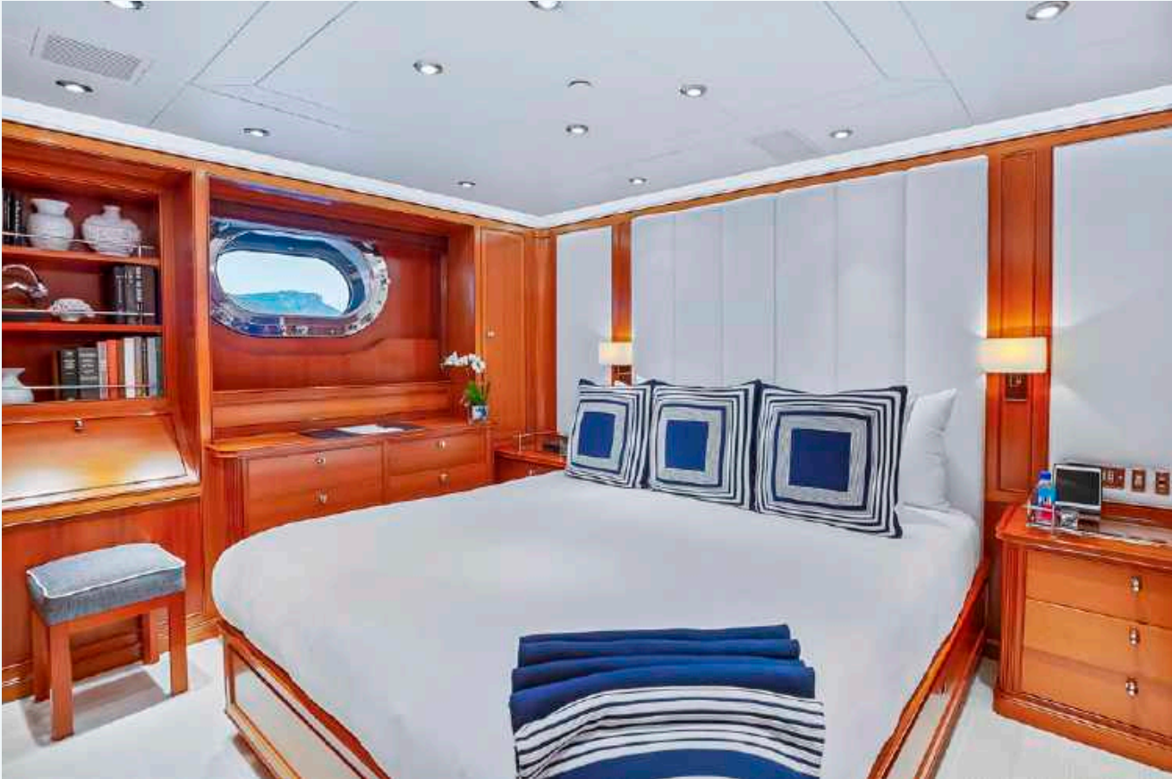
Guest Cabins & Bathroom