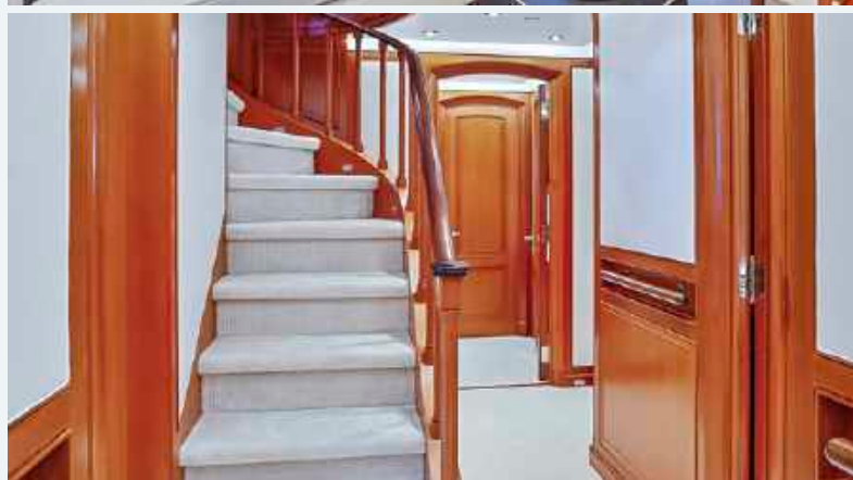
Salon & Hallway