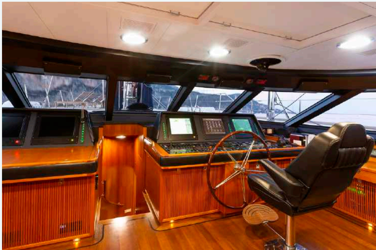
Bridge, Galley & Engine Room