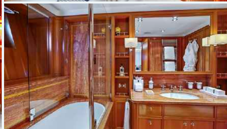
Guest Cabin & Bathroom