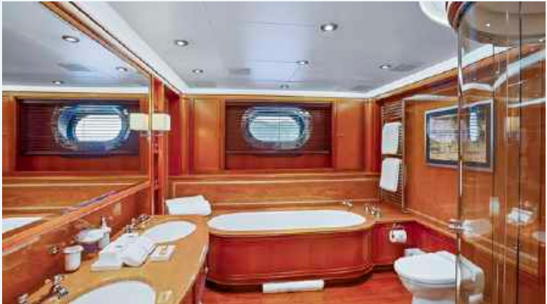
Master Stateroom & Bathroom