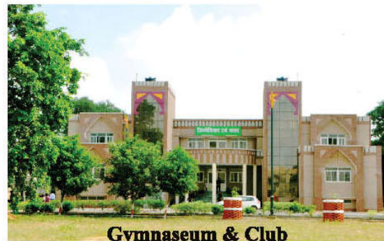
Gymnasium & Club