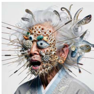
Niceaunties Auntieverse (Feb 24)

A world-building project containing 10 chapters with 100 images each that set the stage for the celebration of 'auntie culture'.