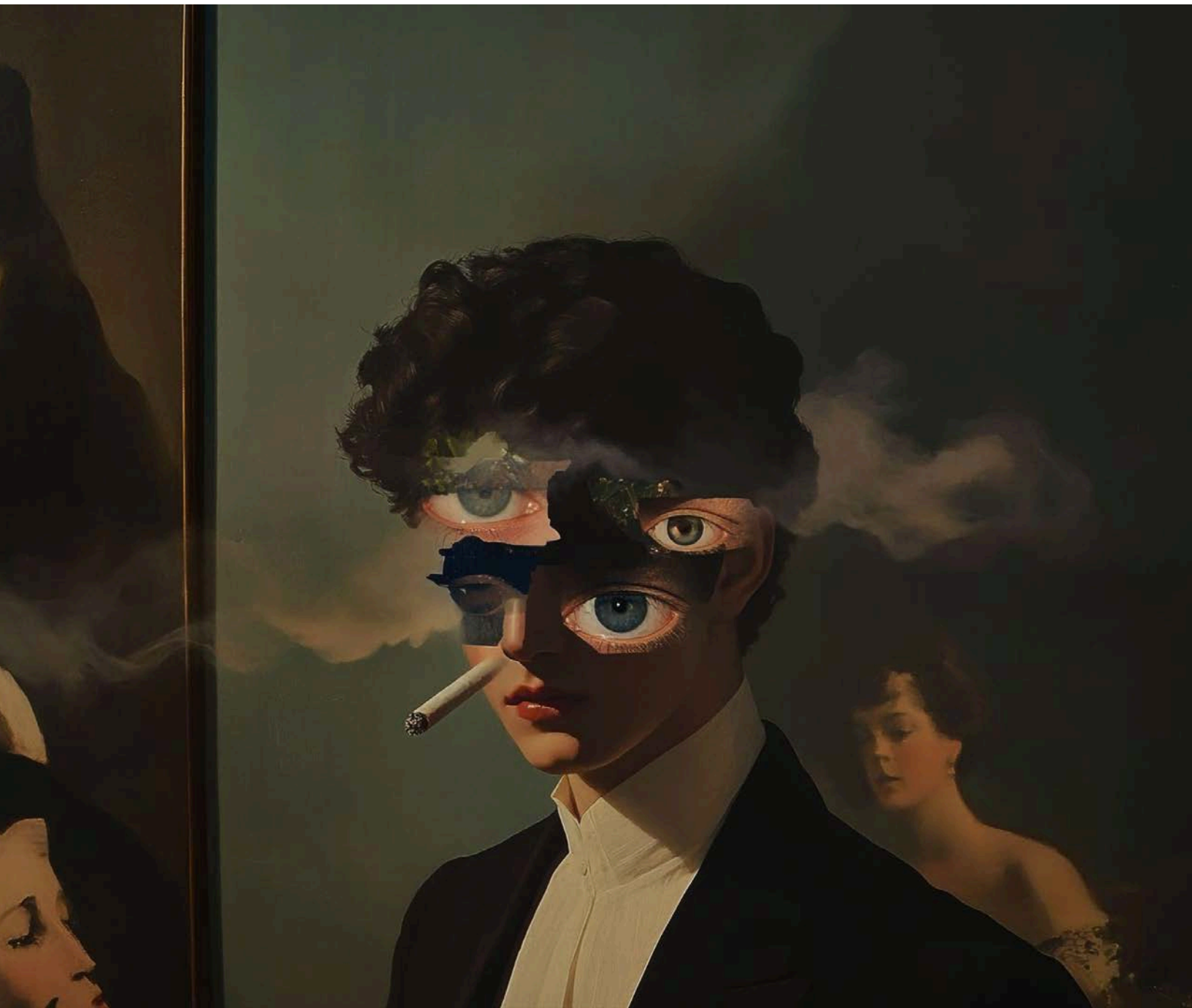
Secondhand Visions , Keke, 2024-25

1/1 NFT edition with accompanying hand-painted artwork, acrylic and oil on linen, 150 x 180 cm | 59.1 x 70.9 in