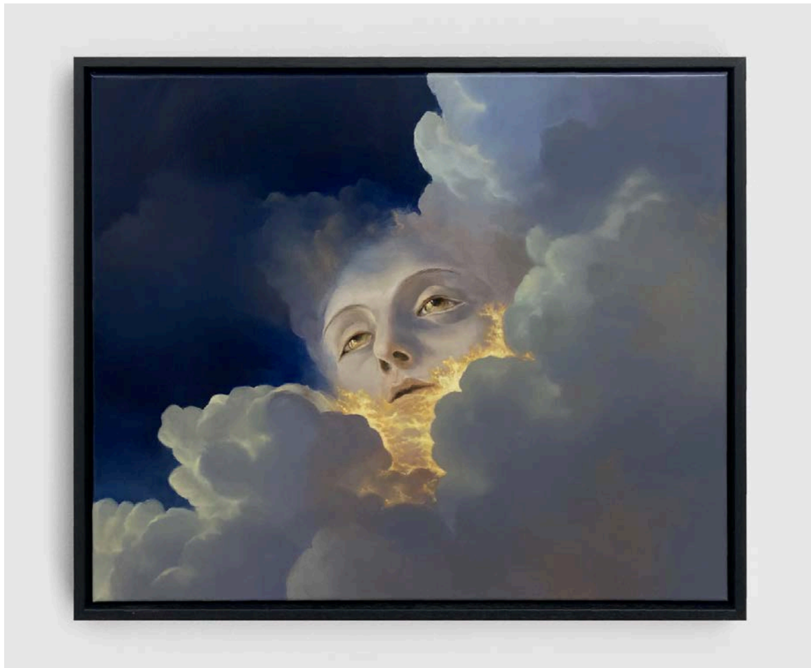
Golden Breath, Keke, 2024-25

100 of the images have been selected to be paired with large-format 150 × 180 cm paintings, while 400 images can be paired with medium-format 50 × 60 cm paintings. These will be available at cost for the digital artwork holder, with production initially handled by The Sable Collective in limited runs. Future production will adapt based on demand and potential new collaborations.