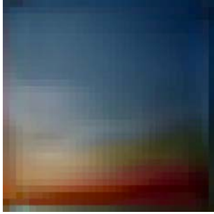
Elman Mansimov alignDRAW (Dec 23)

The first text-to-image model that marked a new era of human-machine collaboration.