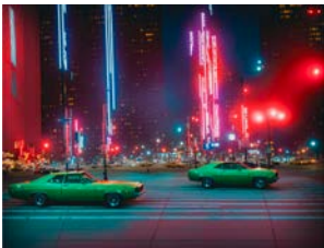
Roope Rainisto REWORLD (Apr 23)

An exploration of society's complexities through the lens of AI-generated images.