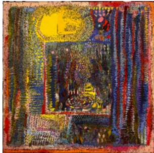
Eko33 Latent Ink (Dec 24)

The highest primary art sale of the year