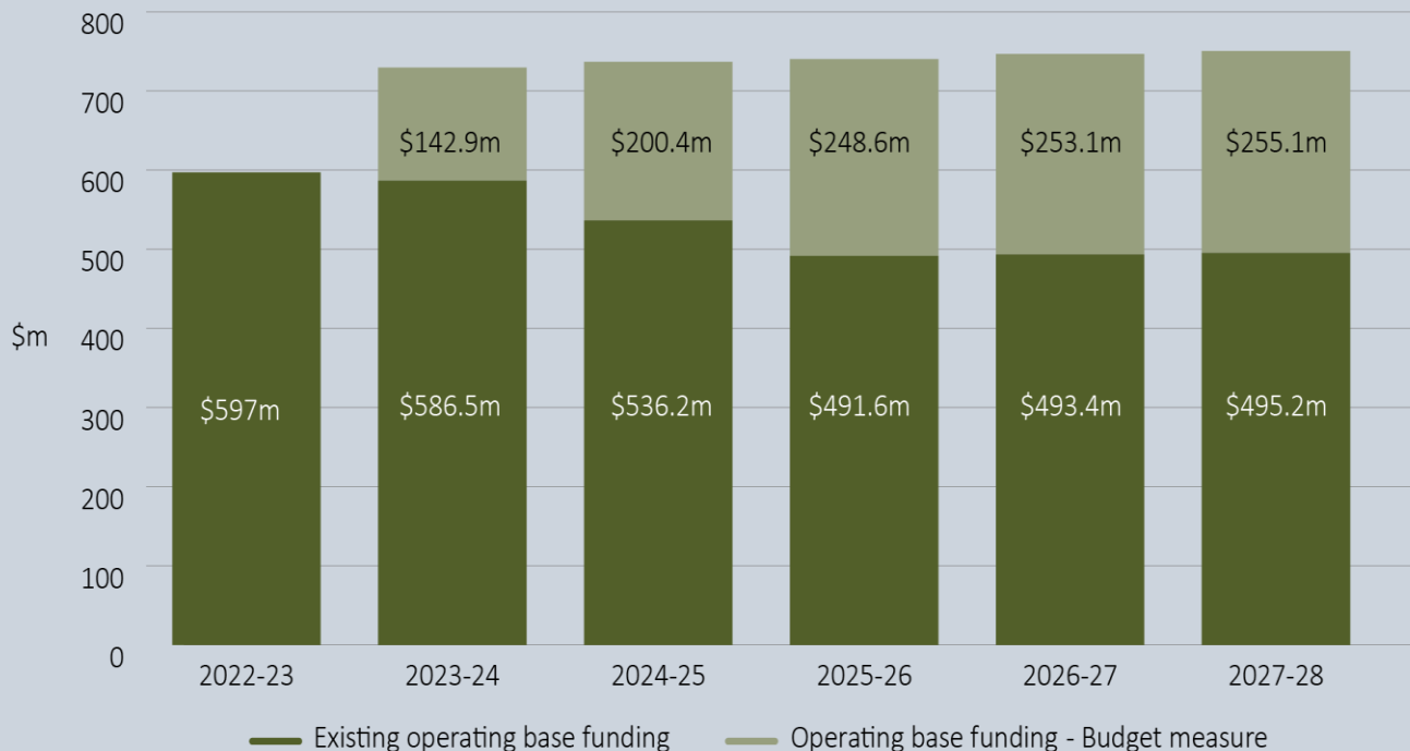
Operating base funding (Existing and with Budget measure)

The above graph shows funding for biosecurity policy, operational and technical functions and includes corporate costs associated with delivering these functions. Funding will be indexed.