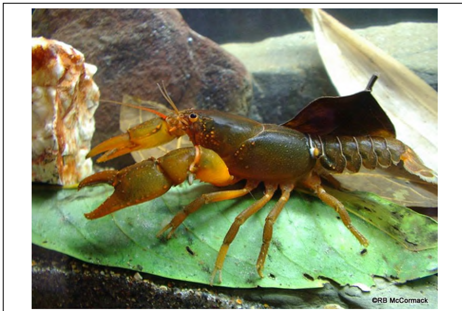
Euastacus balanensis in a captive setting. Image does not depict the species' natural habitat