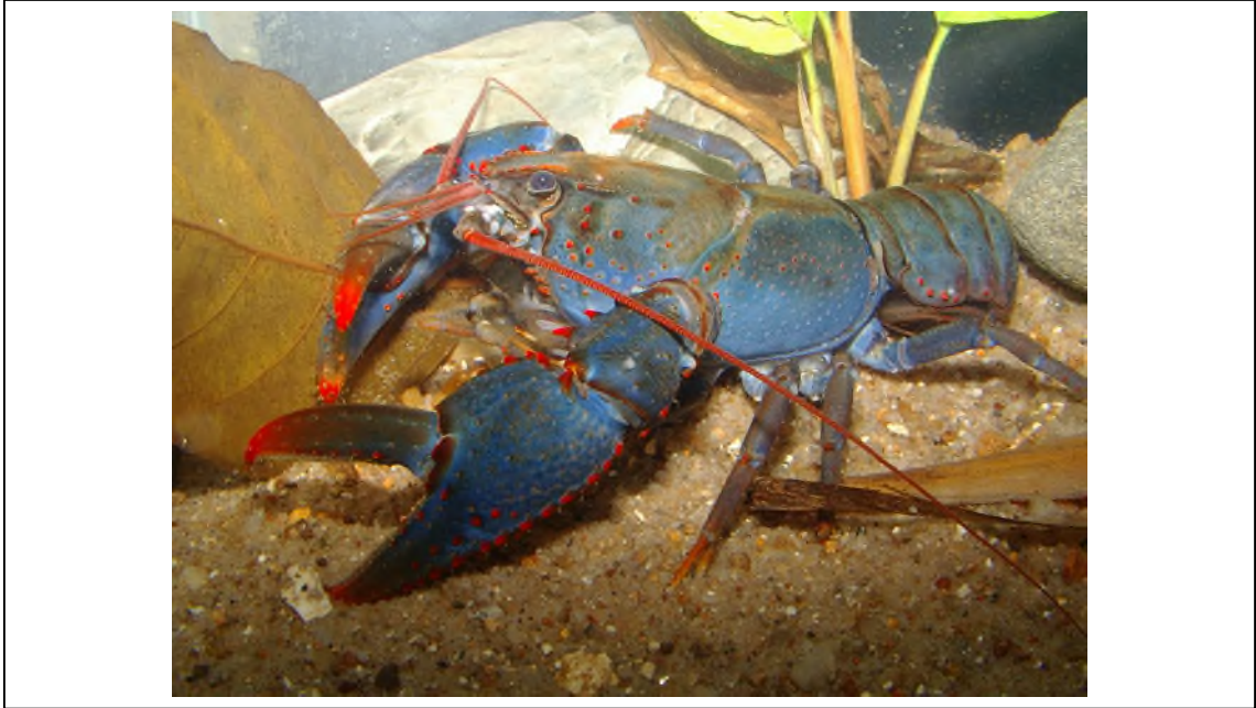
Flecker's crayfish in a captive setting. Image does not depict the species' natural habitat