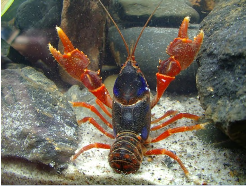
Euastacus yigara in a captive setting. Image does not depict the species' natural habitat